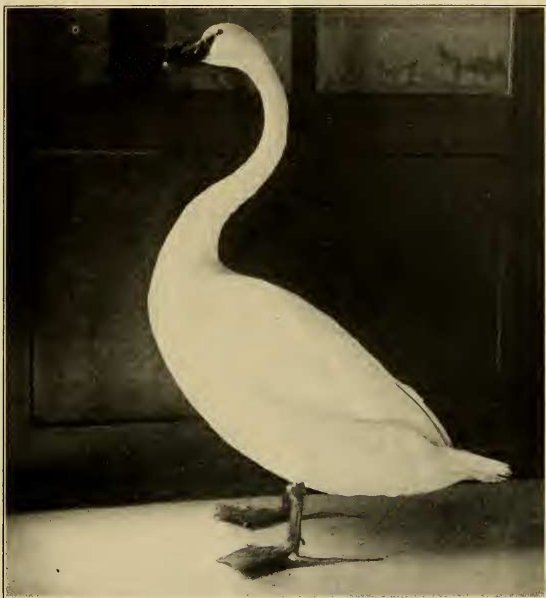
MALE TRUMPETER SWAN ( Olor buccinator ) Collection of the Chicago Academy of Sciences.